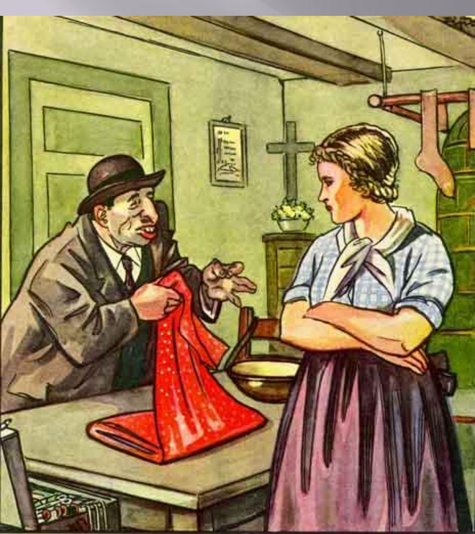
„Hofbäuerin, heut' hab' ich für dich was Besonderes. Schau diesen Stoff an! Das gibt ein Kleid für dich, Hofbäuerin, ein Kleid, du wirst darin aussehen wie eine Baronin, wie eine Fürstin, wie eine Königin...“