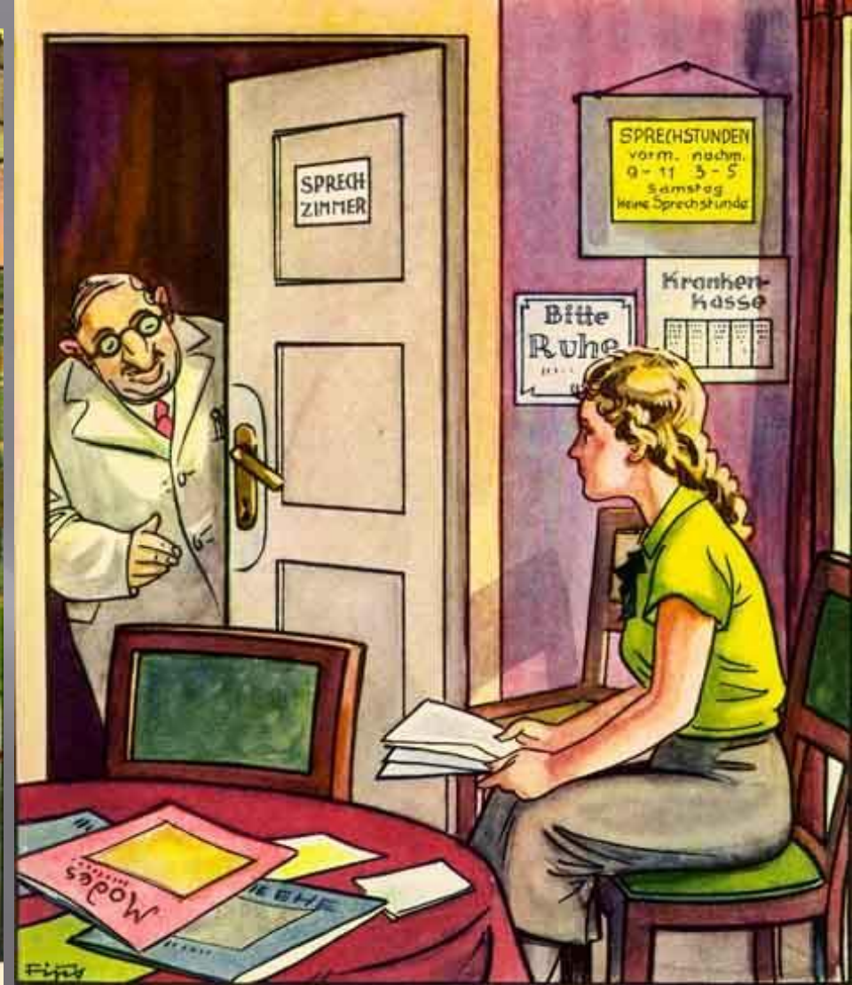
Hinter den Brillengläsern funkeln zwei Verbrecheraugen und um die wulstigen Lippen spielt ein Grinsen.