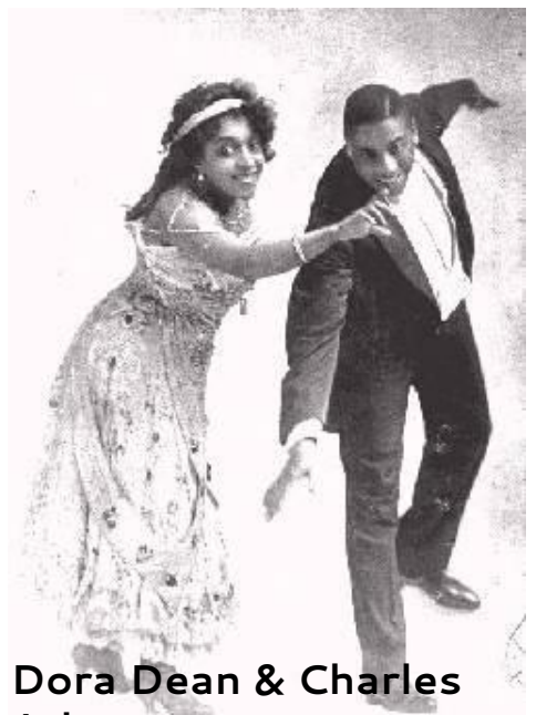
Dora Dean & Charles Johnson