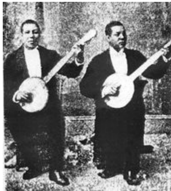
The Bohee Brothers