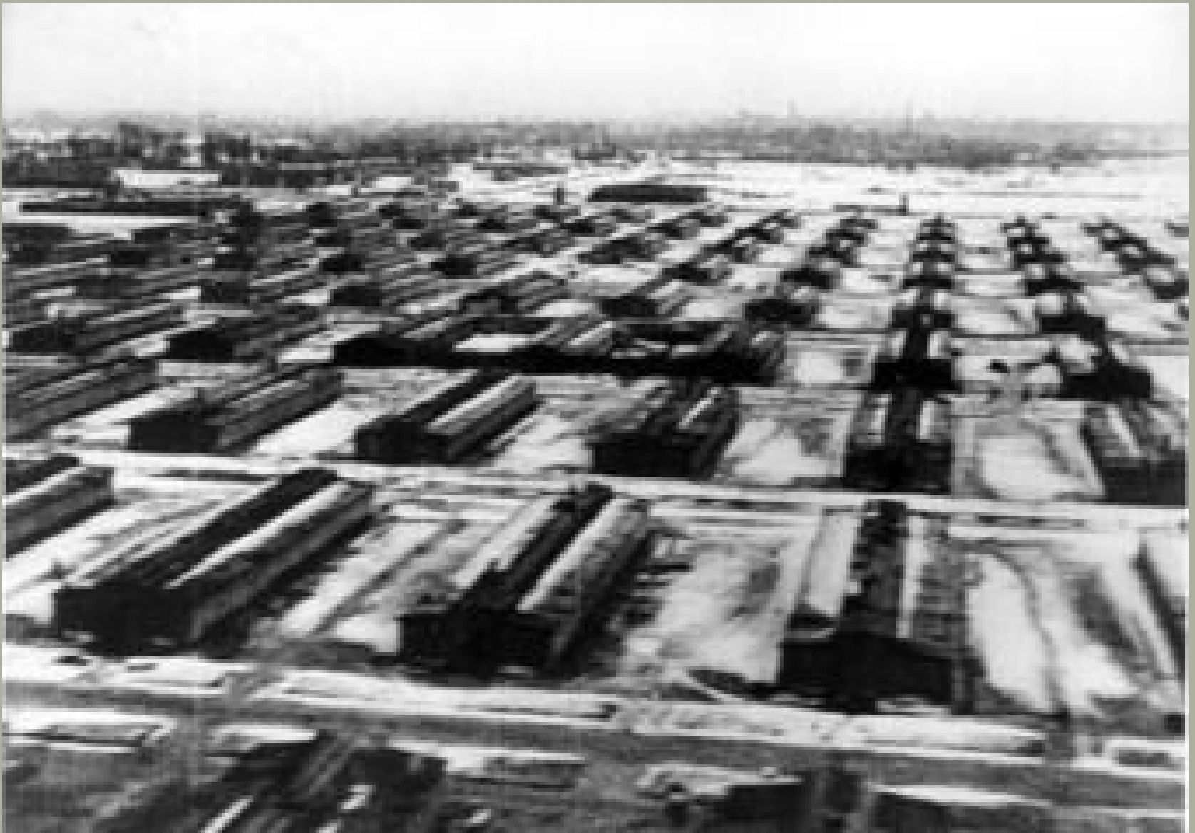
Housing for prisoners at Auschwitz-Birkenau