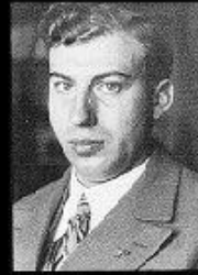
Staatssekretär Dr. Stuckart