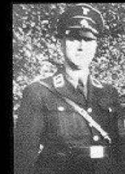
SS-Oberführer Dr. Schöngarth