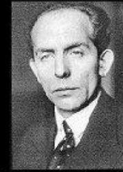
Staatssekretär Dr. Freisler